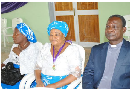
Mothers' Union members attending Second Session of the 19 th Synod on 20 May 2013